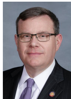
Rep. Tim Moore (R) House Speaker District 111 Cleveland

AGRICULTURE; EDUCATION – UNIVERSITIES; SELECT COMMITTEE ON DISASTER RELIEF; JUDICIARY