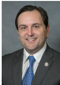
Sen. Rob Bryan (R) District 39 Mecklenburg (Appointed 10/2/19)

APPROPRIATIONS/BASE BUDGET; PENSIONS AND RETIREMENT AND AGING; REDISTRICTING AND ELECTIONS; SELECT COMMITTEE ON PRISON SAFETY; TRANSPORTATION