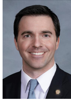
Sen. Jeff Jackson (D) District 37 Mecklenburg

AGRICULTURE/ENVIRONMENT/ NATURAL RESOURCES; APPROPRIATIONS – JPS; FINANCE; JUDICIARY; SELECT COMMITTEE ON PRISON SAFETY; TRANSPORTATION