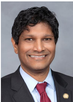
Sen. Jay Chaudhuri (D) Senate Democratic Whip District 15 Wake

APPROPRIATIONS – HEALTH AND HUMAN SERVICES; EDUCATION/HIGHER EDUCATION; FINANCE; HEALTH CARE; JUDICIARY; SELECT COMMITTEE ON NOMINATIONS