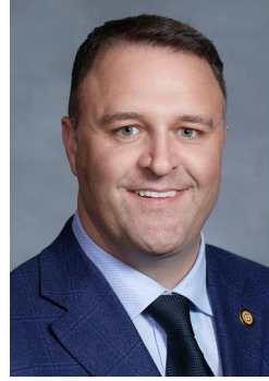
Sen. Sam Searcy (D)

AGRICULTURE/ENVIRONMENT/ NATURAL RESOURCES; APPROPRIATIONS – EDUCATION; PENSIONS AND RETIREMENT AND AGING