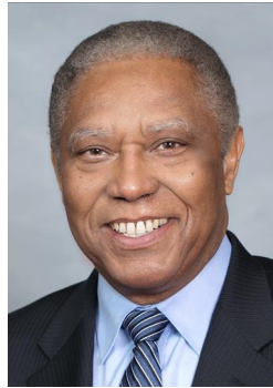
Sen. Dan Blue (D) Senate Democratic Leader District 14 Wake

APPROPRIATIONS – JPS; APPROPRIATIONS/BASE BUDGET; FINANCE; JUDICIARY; REDISTRICTING AND ELECTIONS; RULES AND OPERATIONS; SELECT COMMITTEE ON NOMINATIONS