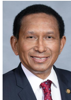
Sen. Floyd McKissick (D) (Resigned 1/7/2020) District 20 Durham

APPROPRIATIONS – AGRICULTURE; JUDICIARY; REDISTRICTING AND ELECTIONS