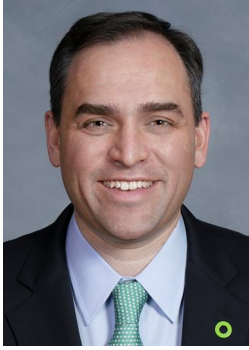
Sen. Wiley Nickel (D)