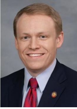
Rep. Destin Hall (R) District 87 Caldwell