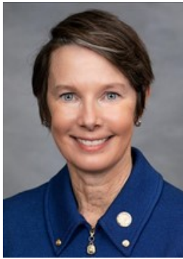
Rep. Rachel Hunt (D) District 103 Mecklenburg

APPROPRIATIONS; APPROPRIATIONS – AGRICULTURE AND NATURAL AND ECONOMIC RESOURCES; ELECTION LAW AND CAMPAIGN FINANCE REFORM; ENERGY & PUBLIC UTILITIES; JUDICIARY 1; MARINE RESOURCES AND AQUACULTURE; REDISTRICTING