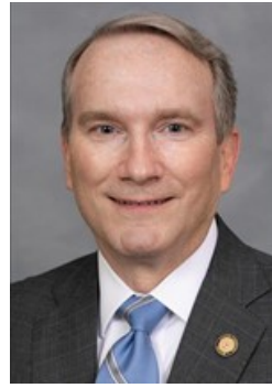
Sen. Paul Newton (R) District 36 Cabarrus, Union

APPROPRIATIONS – AGRICULTURE, ENVIRONMENT, AND NATURAL RESOURCES; APPROPRIATIONS/BASE BUDGET; HEALTH CARE; JUDICIARY; SELECT COMMITTEE ON PRISON SAFETY