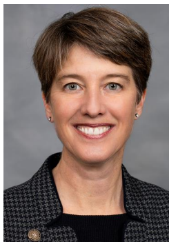
Sen. Julie Mayfield (D) District 49 Buncombe

APPROPRIATIONS – AGRICULTURE, NATURAL, AND ECONOMIC RESOURCES; APPROPRIATIONS/BASE BUDGET; JUDICIARY; REDISTRICTING AND ELECTIONS