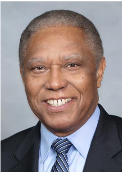
Sen. Dan Blue (D) Senate Democratic Leader District 14 Wake

APPROPRIATIONS – JUSTICE AND PUBLIC SAFETY; APPROPRIATIONS/BASE BUDGET; FINANCE; JUDICIARY; REDISTRICTING AND ELECTIONS; RULES; SELECT COMMITTEE ON NOMINATIONS