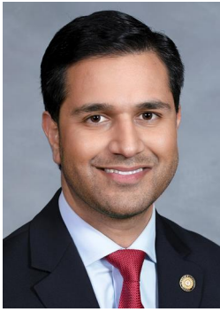
Sen. Mujtaba Mohammed (D) District 38 Mecklenburg

APPROPRIATIONS – AGRICULTURE, ENVIRONMENT, AND NATURAL RESOURCES; APPROPRIATIONS/BASE BUDGET; HEALTH CARE; JUDICIARY; SELECT COMMITTEE ON PRISON SAFETY