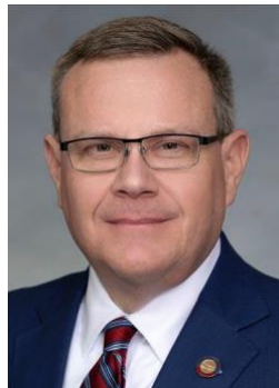
Rep. Tim Moore (R) House Speaker District 111 Cleveland

APPROPRIATIONS; APPROPRIATIONS - HEALTH AND HUMAN SERVICES; EDUCATION - UNIVERSITIES; REDISTRICTING; RULES