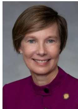
Sen. Rachel Hunt (D) District 42 Mecklenburg

AGRICULTURE, ENERGY, AND ENVIRONMENT; APPROPRIATIONS ON JUSTICE AND PUBLIC SAFETY; JUDICIARY; STATE AND LOCAL GOVERNMENT