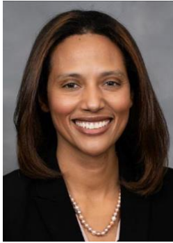
Sen. Sydney Batch (D) District 17 Wake

APPROPRIATIONS – EDUCATION/HIGHER EDUCATION; COMMERCE AND INSURANCE; PENSIONS AND RETIREMENT AND AGING; SELECT COMMITTEE ON STORM RELATED RIVER DEBRIS AND DAMAGE IN NORTH CAROLINA