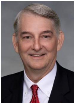
Sen. Buck Newton (R) District 4 Greene, Wayne, Wilson

APPROPRIATIONS - AGRICULTURE, ENVIRONMENT, AND NATURAL RESOURCES; APPROPRIATIONS/BASE BUDGET; HEALTH CARE; JUDICIARY; SELECT COMMITTEE ON PRISON SAFETY