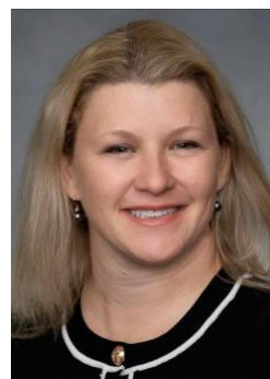
Rep. Laura Budd (D) District 103 Mecklenburg

APPROPRIATIONS; APPROPRIATIONS - HEALTH & HUMAN SERVICES; EDUCATION - UNIVERSITIES; ELECTION LAW AND CAMPAIGN FINANCE REFORM; HEALTH FEDERAL RELATIONS AND HOUSE SELECT COMMITTEE ON HOMEOWNERS' ASSOCIATIONS