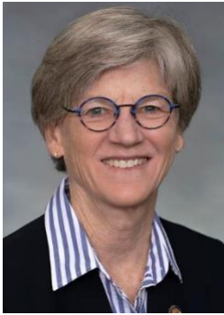
Rep. Marcia Morey (D) District 30 Durham

APPROPRIATIONS; APPROPRIATIONS - JUSTICE AND PUBLIC SAFETY; EDUCATION - UNIVERSITIES; FAMILIES, CHILDREN, AND AGING POLICY; JUDICIARY 2; TRANSPORTATION