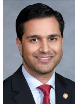
Sen. Mujtaba Mohammed (D) District 38 Mecklenburg

APPROPRIATIONS - AGRICULTURE, NATURAL, AND ECONOMIC RESOURCES; SELECT COMMITTEE ON STORM RELATED RIVER DEBRIS AND DAMAGE IN NC; STATE AND LOCAL GOVERNMENT; TRANSPORTATION