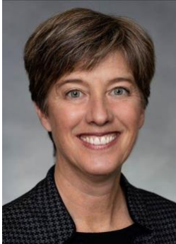
Sen. Julie Mayfield (D) District 49 Buncombe

APPROPRIATIONS - AGRICULTURE, NATURAL, AND ECONOMIC RESOURCES; SELECT COMMITTEE ON STORM RELATED RIVER DEBRIS AND DAMAGE IN NC; STATE AND LOCAL GOVERNMENT; TRANSPORTATION