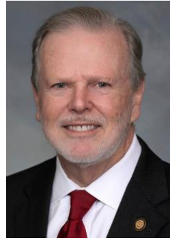
Sen. Phil Berger (R) Senate President Pro Tempore District 30 Caswell, Rockingham, Stokes, Surry

APPROPRIATIONS – EDUCATION/HIGHER EDUCATION; COMMERCE AND INSURANCE; PENSIONS AND RETIREMENT AND AGING; SELECT COMMITTEE ON STORM RELATED RIVER DEBRIS AND DAMAGE IN NORTH CAROLINA