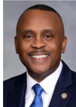
Rep. Robert Reives, II (D) House Democratic Leader District 54

APPROPRIATIONS; APPROPRIATIONS - JUSTICE AND PUBLIC SAFETY; EDUCATION - UNIVERSITIES; FAMILIES, CHILDREN, AND AGING POLICY; JUDICIARY 2; TRANSPORTATION