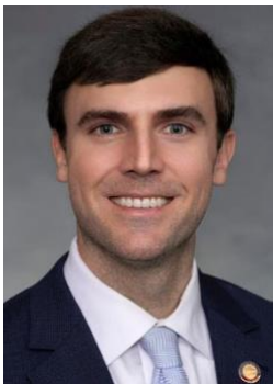
Rep. Charles Smith (D) District 44 Cumberland

AGRICULTURE; APPROPRIATIONS; APPROPRIATIONS - JUSTICE AND PUBLIC SAFETY; JUDICIARY 2; REDISTRICTING; RULES